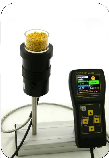
MA38 Set for measuring samples with the ColorLite sph900

To measure granules or other inhomogeneous samples it is necessary to scan over a relative large area. ColorLite offers customers an adapter MA38 to expand the measuring area of a normal probe head to 38 mm in diameter. This means the accessory makes it possible to measure solids such as moulded plastics, as well as for measuring granules with one ColorLite spectrophotometer.