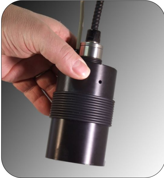
Probe head adapter MA38