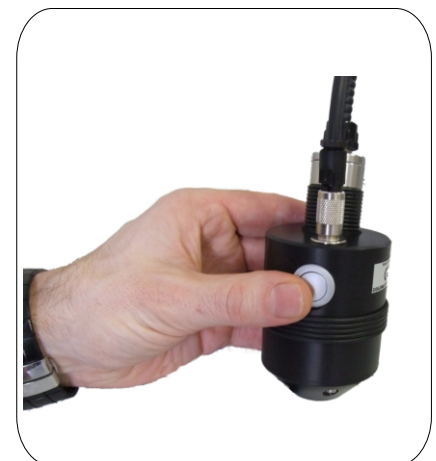
d/8° Messkopf Adapter