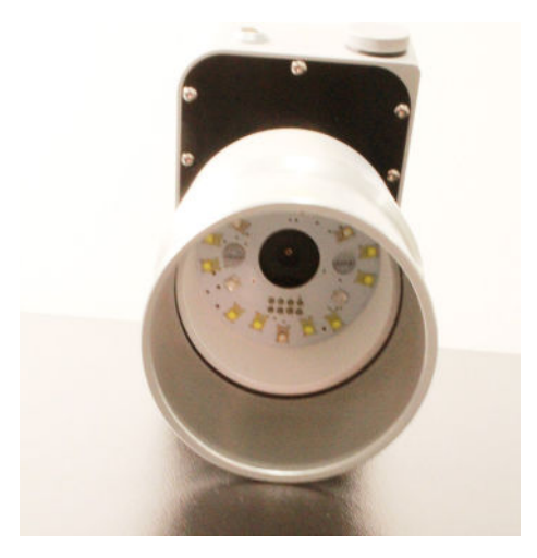
d/0° measurement geometry Measuring area 38 mm