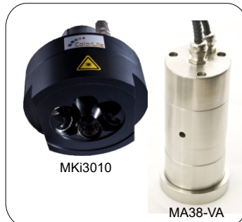
Different probe heads: 45°/0° or d/0°