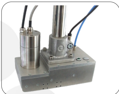
MA38-VA probe head and automatic calibration unit with integrated reference

By measuring slightest (for the human eye non-visible) colour deviations direct in the production, faults can be detected long before tolerance limits are reached. This greatly reduces a main reason for complaints, saving time and money and improving product quality.